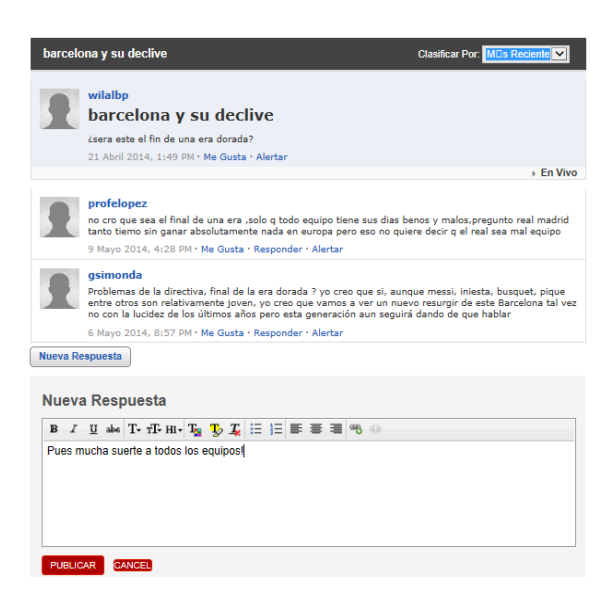
Fig. 3 Web Application Web using Comet with Grails