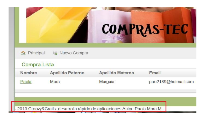
Fig. 2 Grails-based Web Application using templates.

In Fig. 3, an example of employing the Comet support by using a Web chat for the ESPN web site is shown. This example represents a Grails-based Web application which allows multiple conversations/interactions with students. The Atmosphere plugin is used and with this feature Web application is busy, dynamic and interactive.